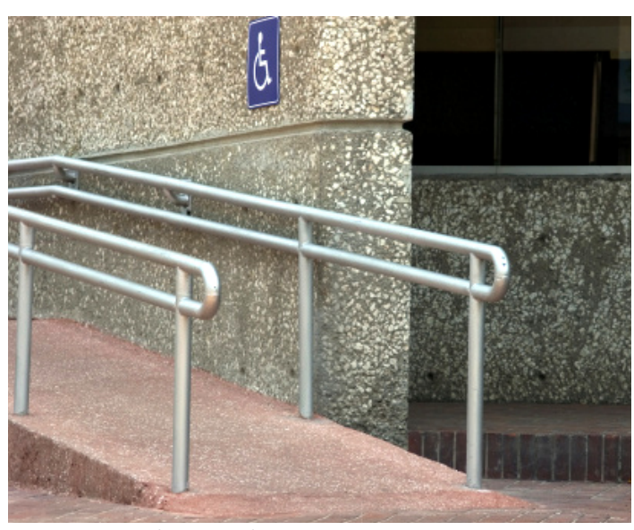
Figure 3 – Needs entry edge contrast.

Learn more about managing slip and fall risks at cna.com/riskcontrol (US) or cnacanada.ca (Canada).